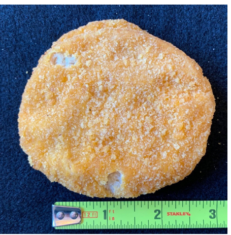
Figure 3. A chicken patty with two continious coating voids but each less than ½ inch in diameter so there is no defect.