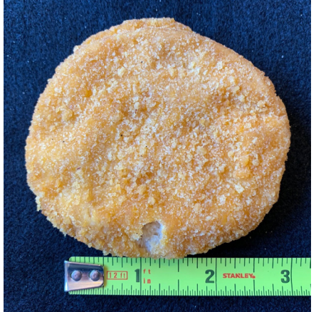
Figure 2. A chicken patty with a continious void less than ½ inch in diameter so there is no defect