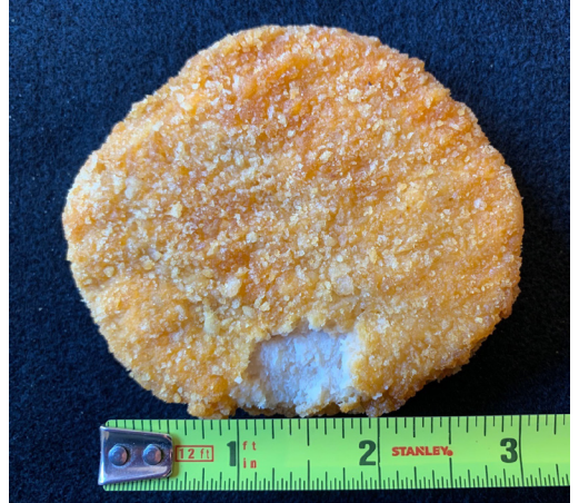
Figure 1. A chicken patty with a continious void greater than ½ inch in diameter. The defect would be listed as a COATING DEFECT

Boneless poultry products are breaded for taste and customer appeal. Typically, a golden-brown color is expected. Subtle differences are normal during the production of breaded products. You should expect the color to be uniform across all products displayed in a group as established by two or more of the products displayed. If one of the products is noticeably darker or lighter than the other two products, it is a color defect. For single items, the color should be uniform across the entire item and should not contain dark, burnt areas, or other contrasting colors in the coating of the product.