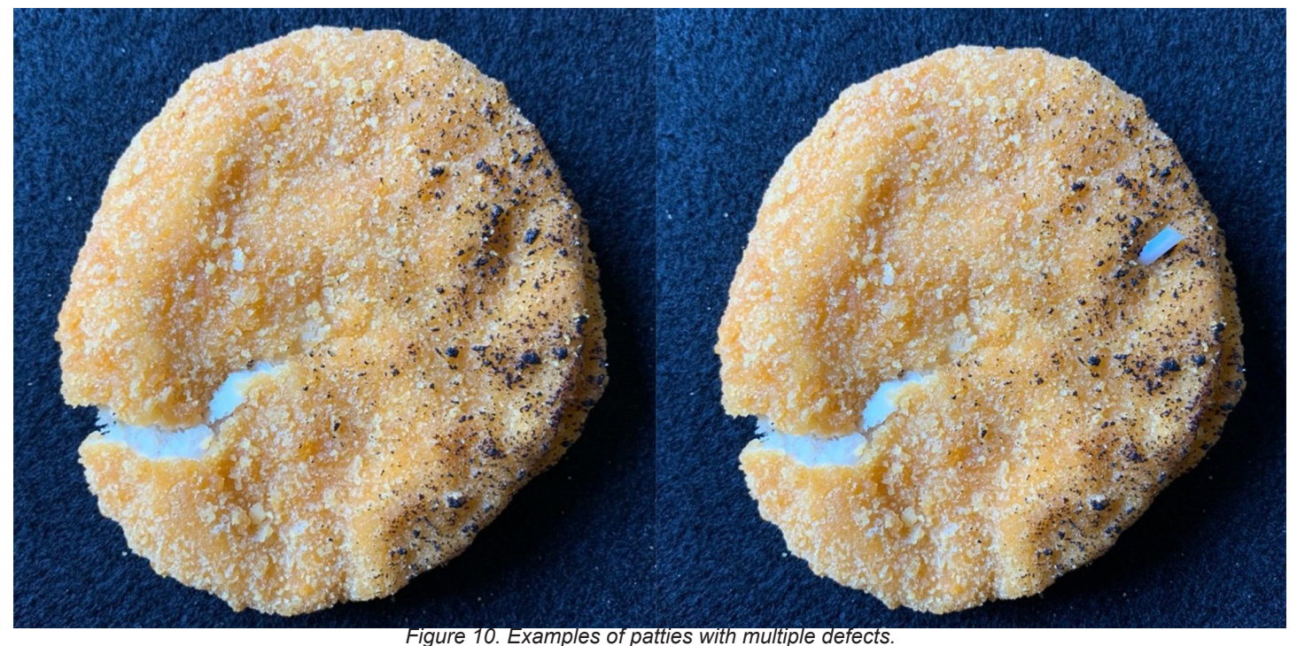
The patty on the left would be marked 'BROKEN/INCOMPLETE' and 'COATING DEFECT'. The patty on the right has three defects -'BROKEN/INCOMPLETE,' 'COATING DEFECT,' and 'EVIDENCE OF FOREIGN MATERIAL.'

Since the contestants cannot handle the product, they should only evaluate the portions that are fully visible. Be careful not to create multiple defects when one defect causes the other factors by the nature of the main defect. For example, if a patty is broken in half and only one half is displayed, you should record "Broken/Incomplete" as the defect even though it is a different shape or may be missing some breading where the break occurred. You do not record the "Coating Defect" or "Shape/Size Defect" since they are a result of the broken patty.