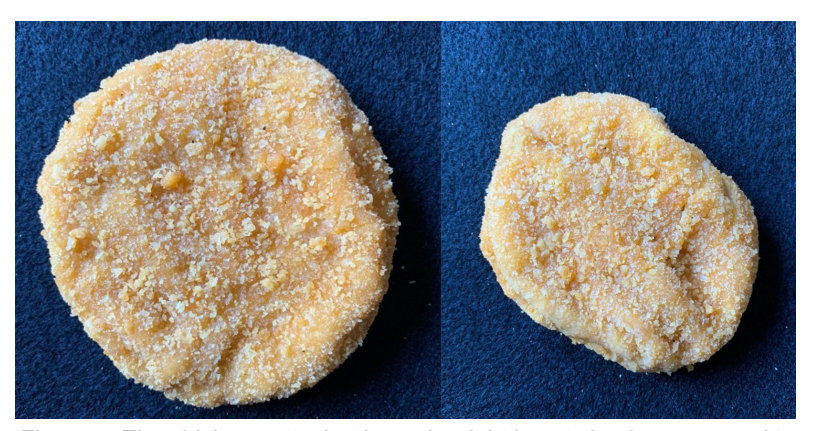
Figure 5. The chicken patty that is on the right is not circular compared to the one on the left. CONSISTENCE OF SHAPE/SIZE would be listed as the defect

The inconsistent size or shape of the product is based on the uniformity of a product line. There are many shapes and sizes of boneless chicken products. For example, nuggets are processed in a variety of shapes from stars to dinosaurs. Slight variation is expected, however, substantial differences or variations in shape and size of products can affect consumer preferences and cook times. Standard product size and shape should be determined in each group by using two or more pieces of similar size. If there are clear differences in the uniformity of product size or shape in the sample, or if the product is folded prior to breading or while processing and the product take on a shape not consistent with the other samples, record "Consistency of size/shape defect'.