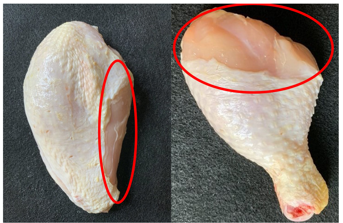
Figure 2. Grade B parts (breast quarter without wing on the left and drumstick on the right) because of excessive skin trim along the edges (more than \frac{1}{4} inch but less than \frac{1}{3} of the part)