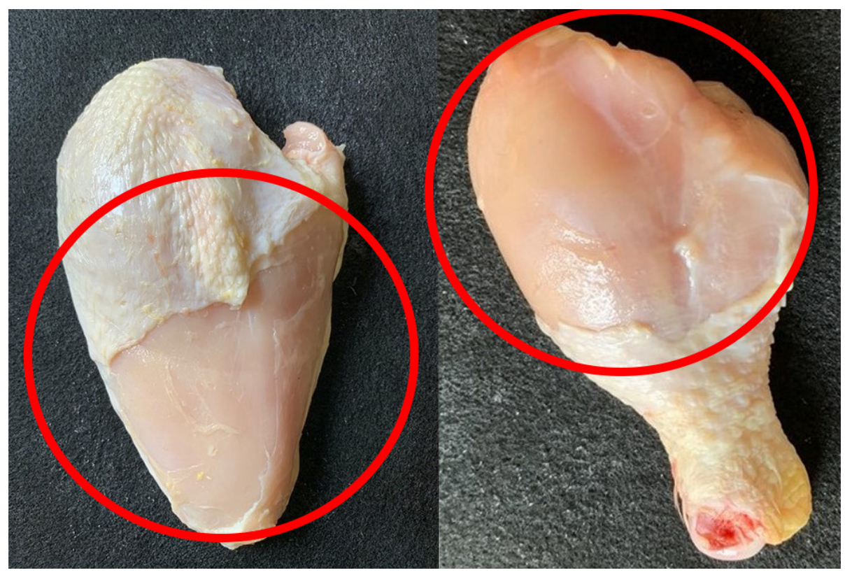
Figure 3. Grade C parts (breast quarter without wing on the left and drumstick on the right) with greater than 1/3 of the flesh missing